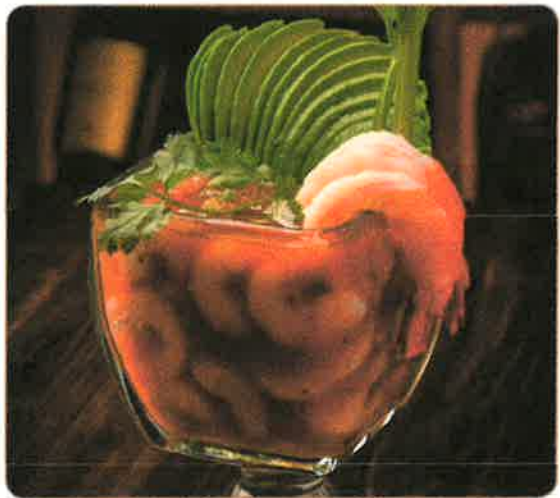
GRINGO SHRIMP COCKTAIL 5 Large shrimp served with our homemade cocktail sauce.