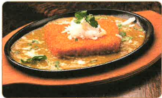
CARIOCA FRIED CHEESE Deep fried cheese topped with cilantro and onions over our delicious green sauce.