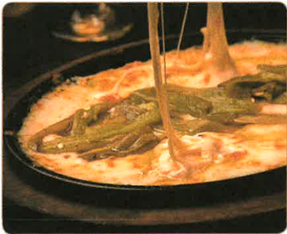
MELTED CHEESE WITH GRILLED RAJAS OR CHORIZO