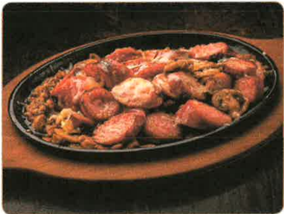
CORRALITO SAUSAGE 1/2 LB Sausage with sautéed mushroom and grated cheese. An appetizing option to start your meal.