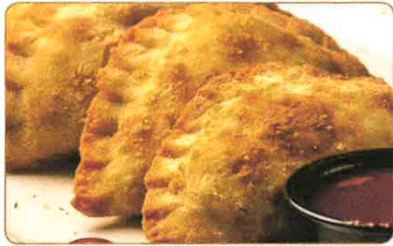
EMPANADAS CORRALITO 4 Shredded beef empanadas with a spicy kick of salsa on the side.