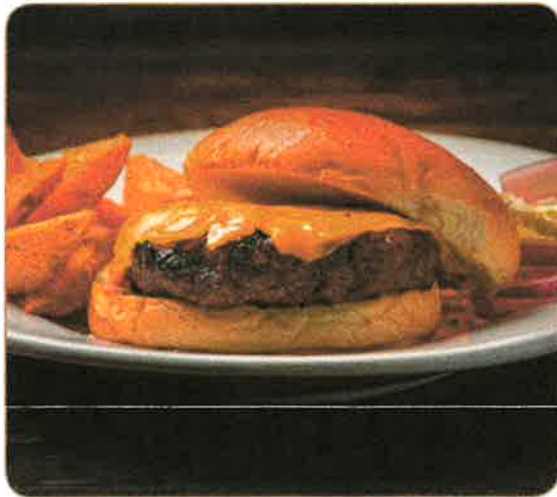
CLASSIC BURGER 10.99 Homemade burger with the finest combination of our meats. 1/2 lb burgers.