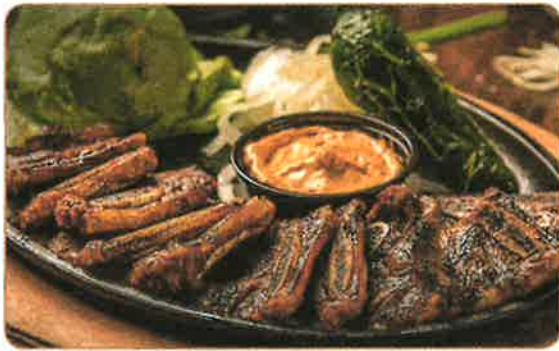
GRILLED SHORT RIBS (1 LB) Finger Short Ribs accompanied with grilled onions, jalapenos and spicy cream sauce. Beware, this creamy goodness is a new level of spiciness.