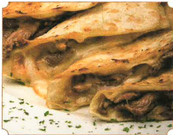
SIRLOIN OR CHICKEN QUESADILLAS 14.99 3 grilled quesadillas