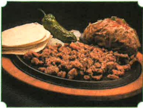
SIRLOIN/CHICKEN TACOS 13.99 - Mexican Style Upgrade 3.99