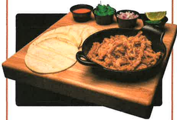
PULLED PORK TACOS 13.99 Pulled pork and melted cheese